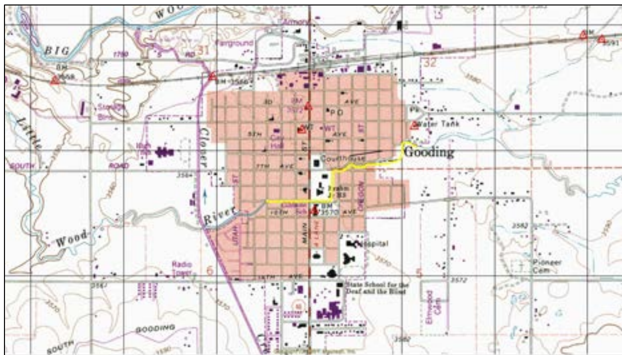
Figure 2. General Location of the Little Wood River through Gooding, Idaho