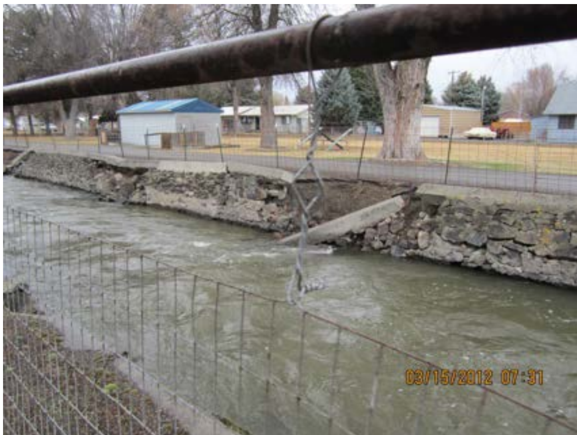
Figure 1. Example of Failing Walls on the Little Wood River at Gooding, Idaho

This project is authorized by Section 3057 of the Water Resource Development Act of 2007 (Public Law 110-114 Section 3057) and under WRDA 2022. Section 3057 directs the Secretary [and in turn USACE] to rehabilitate the Gooding Canal for the purposes of flood control and (if feasible) ecosystem restoration.