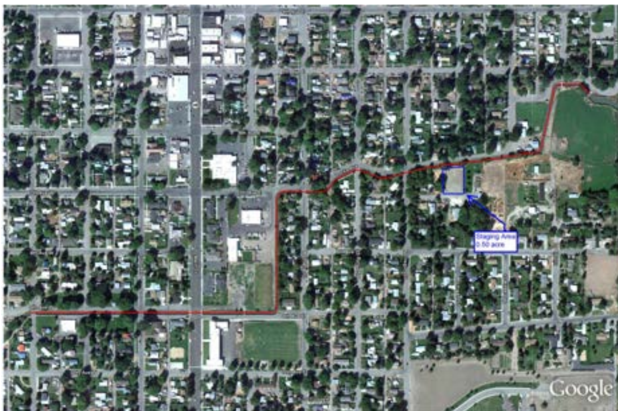
Figure 4. Equipment Staging Area for the Project