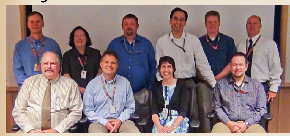
Members of the Walla Walla District's 2013 Leadership Development class are all smiles as they prepare to graduate.

Hydraulic Engineer District Headquarters