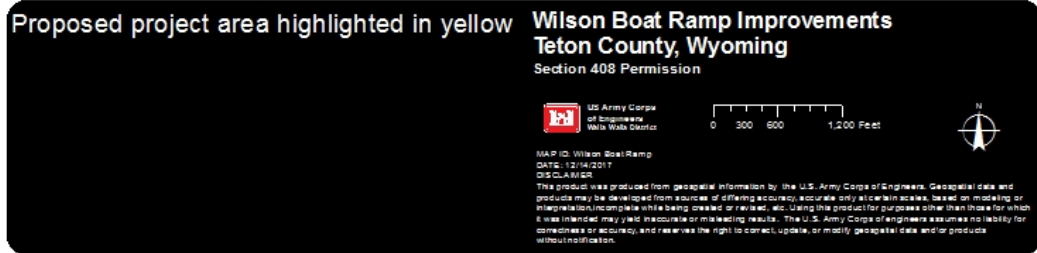
Figure 1. Location map of the potential alteration.