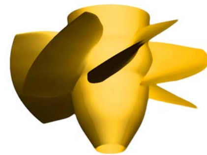
Kaplan-style Existing Runner