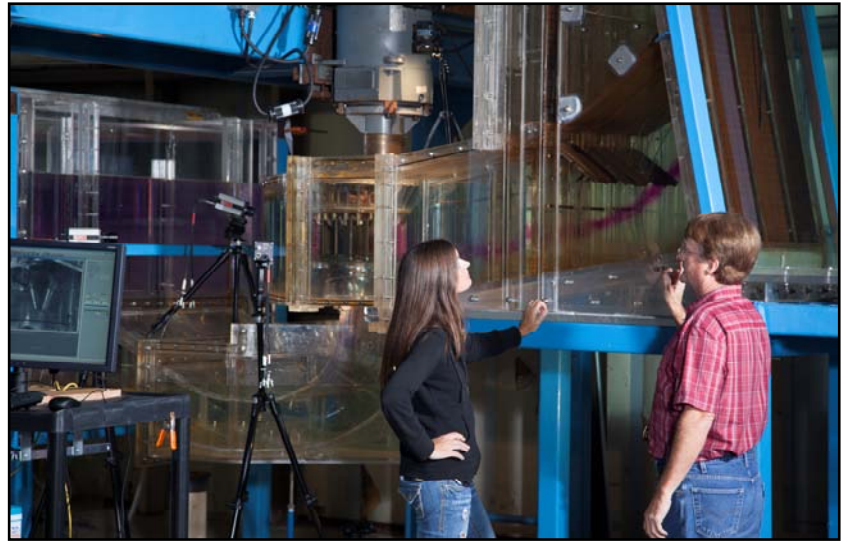
Researchers collect hydraulic data from a scale model of the new Ice Harbor Dam turbine at the U.S. Army Corps of Engineers' Engineering Research and Development Center in Vicksburg, Mississippi. The turbine model is about 1 foot wide; the actual turbine is about 23 feet in diameter.

Most out-migrating fish use surface passage, such as spillway weirs, on their way to the ocean. About 93 to 96 percent of all young salmon and steelhead now survive passage at each dam in the Federal Columbia River Power System.